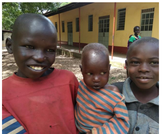
Malnourished child coming to get food