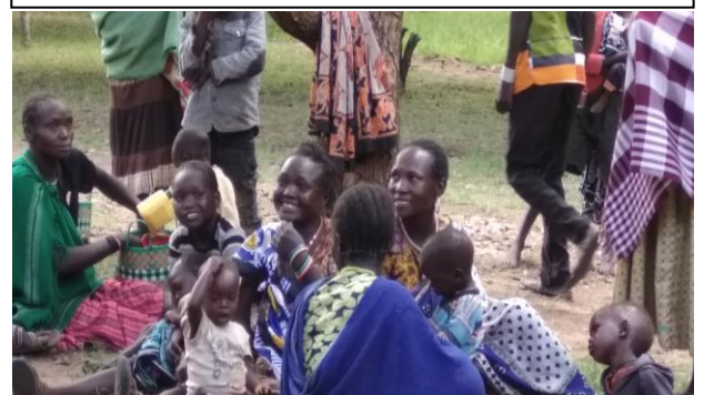
Women attending educational talks