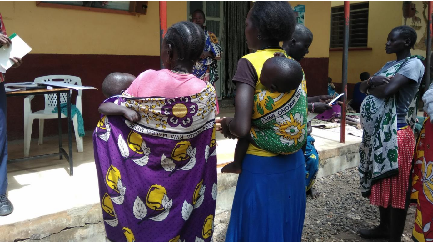
Women waiting to have their children vaccinated