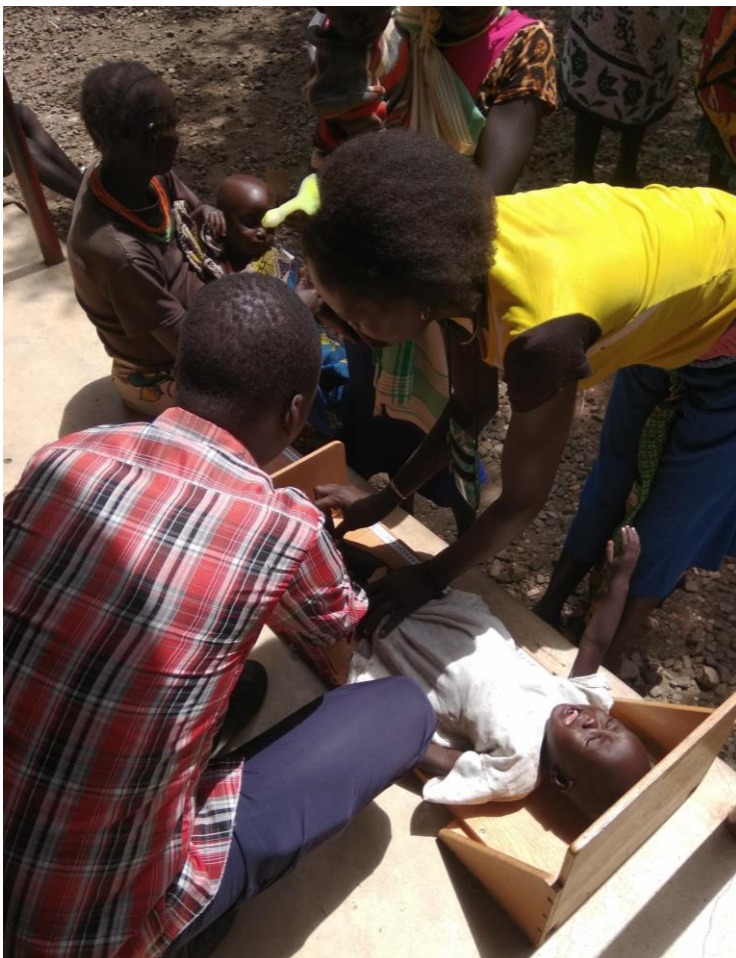
Measuring a malnourished child